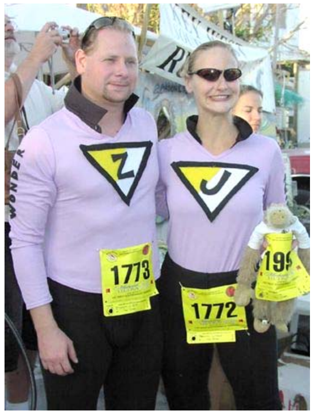
Just a sample of the festive attire of the Fantasy Mile

As usual, your season score is your best six (6) races, but this year, if you run more than six, you get a point for the 7^{th} and 8^{th} ones.