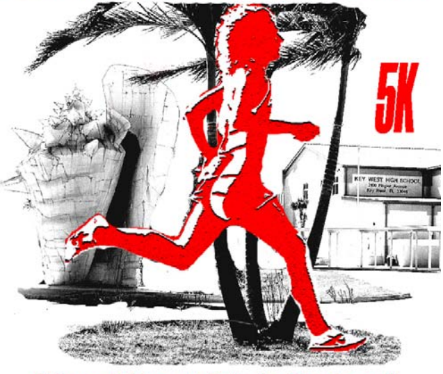
Key West High School 25 August 2007